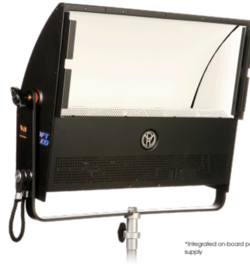
*integrated on-board power supply